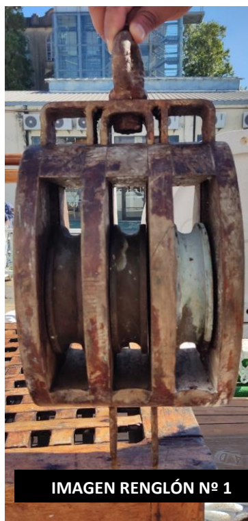
IMAGEN RENGLÓN Nº 1